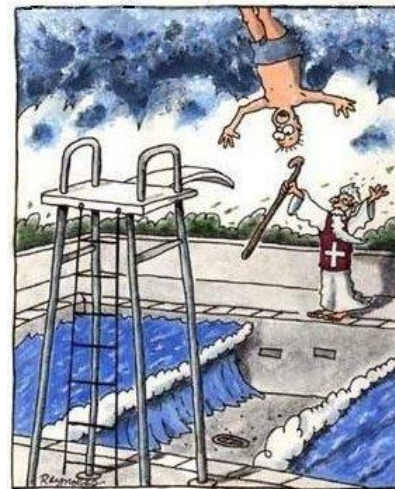
Moses' first and last day as a lifeguard.